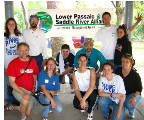
Hard-working organizational members of Lower Passaic & Saddle River Alliance

The entire event was worthy of an annual event, so expect to hear announcements for the next Annual Passaic River Paddle Relay very soon. The Education/Outreach Committee has a motto: " The best way to see the Passaic River is by being on the river. " When neighbors of the River understand its impact on their lives, a natural stewardship arises. The Committee is comprised of hard-working New Jersey residents who want to revive the beautiful Passaic River, once the heart and soul of New Jersey. Join Us!