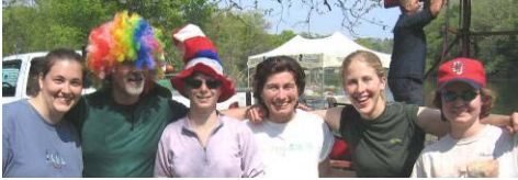
Winning canoe team, the Hoboken Elite

Among the dedicated workers at the festival were the