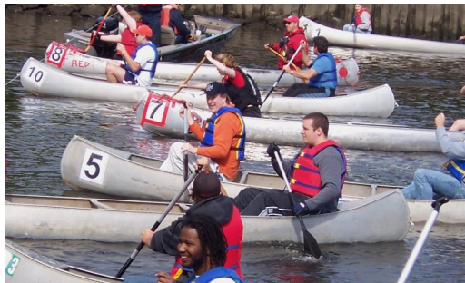
Paddlers lining up at the starting line at the Nereid Boat Club

One of the highlights of our year is the opportunity to enable our community to experience the Lower Passaic River by paddling on the River in the Annual Passaic River Paddle Relay. Held on May 20th, with the weather cooperating, our 8 mile course ran from the Nereid Boat Club in Rutherford to the Riverbank Park in Newark, with two transitions. Twelve teams of six paddlers entered, as well as individuals who wanted to experience the Passaic. A total of 86 paddlers in kayaks and canoes entered.